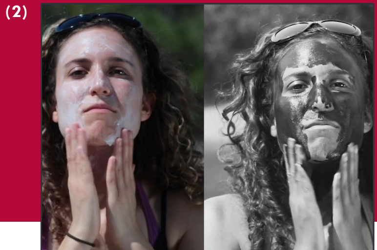
Image (1). The Reveal camera reveals underlying sun damage by imaging increased pigmentation (bottom left) and new blood vessel growth (bottom right). (2). A modified DSLR camera shows users what the sun sees by filtering out the visible spectrum and imaging the UV spectrum. This allows the user to see the effects of sunscreen live on a large screen television.

To make the Sun Bus's education objective both engaging and memorable, this mobile education classroom will integrate state-of-the-art Ultraviolet Cameras to view past sun-damage and the protection offered by sunscreens. Personal sunscreens will be available free of charge to any passing patron.